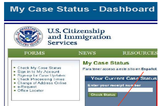
Access to the USCIS web site in Spanish

The USCIS website also contains a new video on the Naturalization process and Naturalization interview.